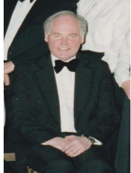
Committee Member 1991

His potential was recognised almost immediately when, after one year as a member, he became Concert Manager. This was the first of many roles he held. He was a committee member, Business Manager, Chair of the Artistic sub-committee, Deputy Chairman of the Society. and had two tours as Chairman, from 1990 to 2005 and from 2016 to 2018. This is an awesome record and his detailed knowledge of HCS was unrivalled. It was, therefore very fitting that he should be made a Life Member of the Society in 2005 and Vice President of the Society in 2018 -an honour that he cherished greatly.